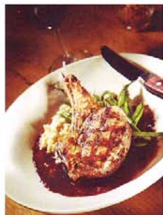
Clockwise from left: Seared scallops with wilted spinach and asparagus at Smyth; Branded's signature half-pound prime beef burger; Smyth's grilled veal chop with risotto