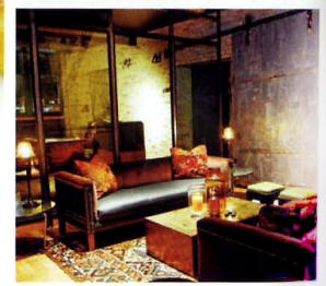
Clockwise from top left: The Iron Horse Hotel kept the Berger Bedding and Furniture Factory's original timber beams; paté at Bartolotta's Lake Park Bistro; the lobby at the Iron Horse Hotel.